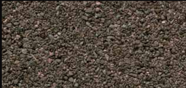
WEATHERED WOOD ●◆