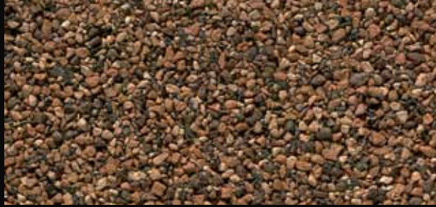
RUSTIC CEDAR ●◆