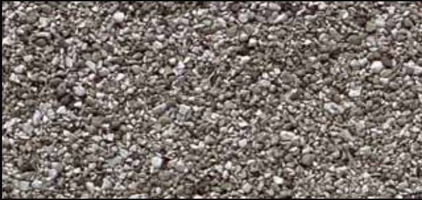
GREY BLEND ●