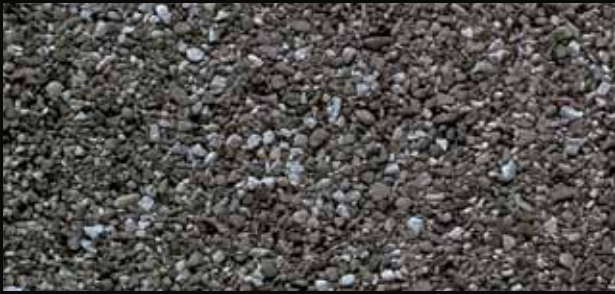
ANTIQUÉ SLATE ●◆