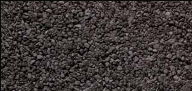
RUSTIC BLACK ●◆