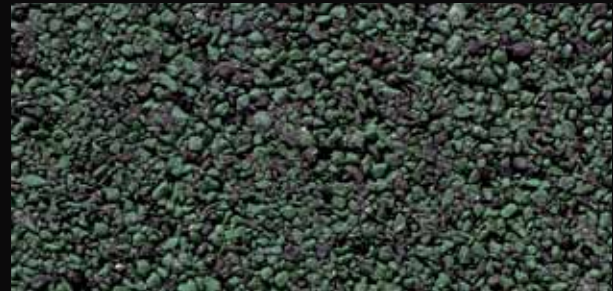
EMPIRE GREEN BLEND ●

Elite Glass-Seal® available in colors marked with a ● Glass-Seal available in colors marked with a ◆