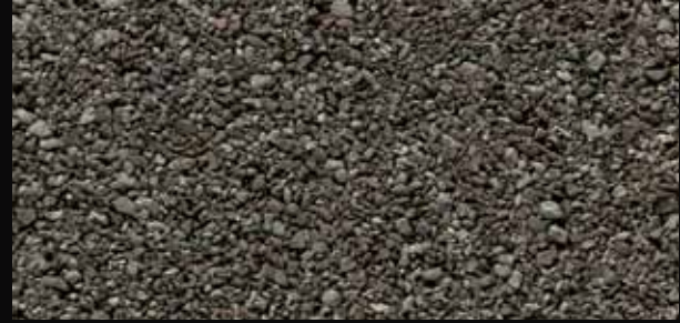
OXFORD GREY ●