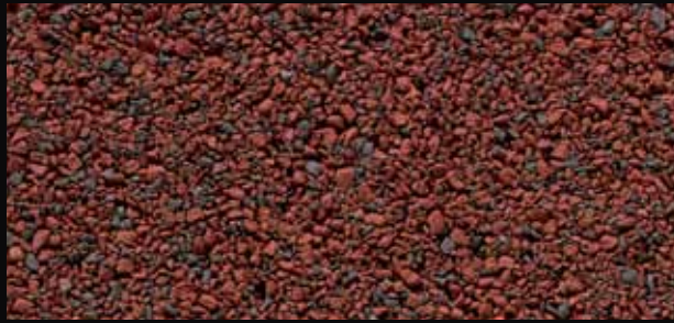
TILE RED BLEND ●