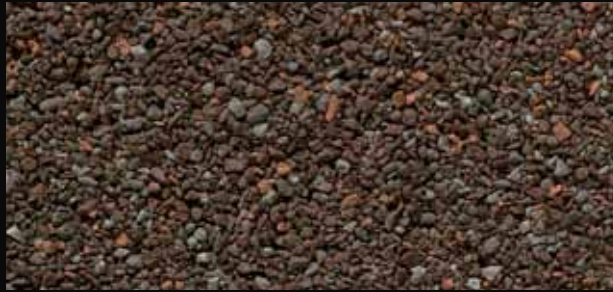
RUSTIC SLATE ●