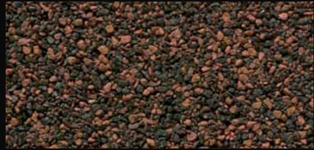
RUSTIC HICKORY ●◆