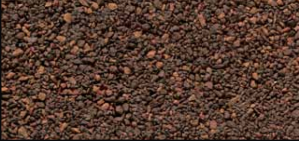
TWEED BLEND ●◆